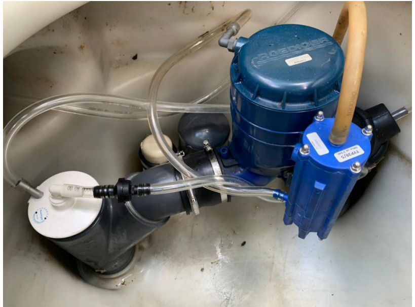
Chamber pod self-evacuation unit properly installed , this will eliminate any water ponding in pod due to heavy rain