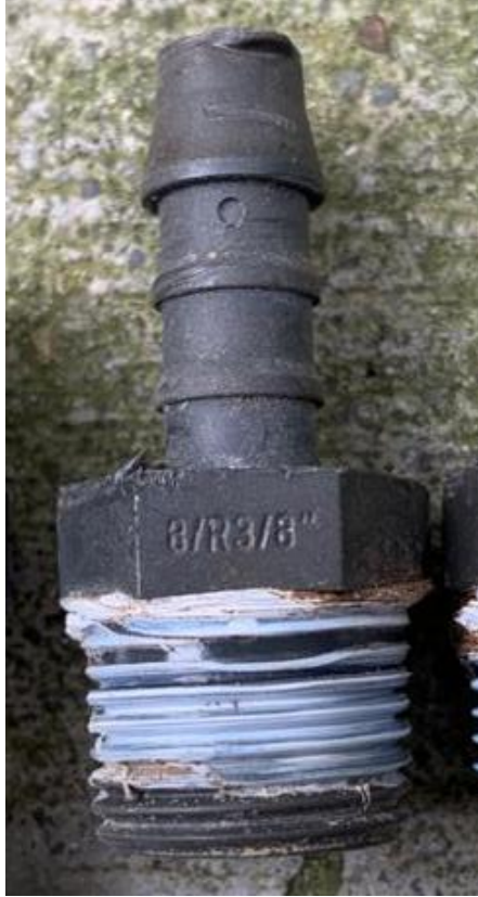
Broken 8/R 3/8" adapter replaced