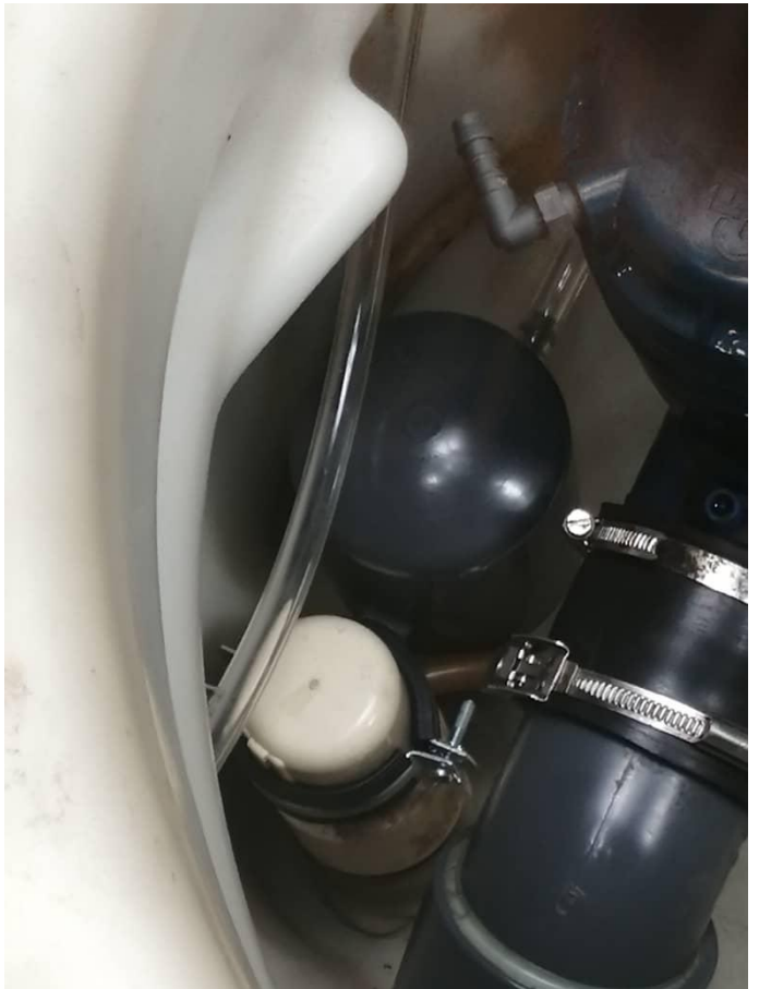
Chamber pod self-evacuation unit