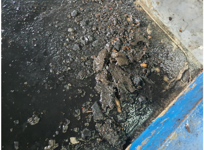
we collected the remaining debris after flushing out works