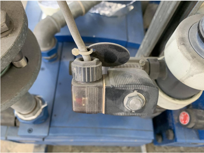
We checked the 24v relay for the condensate trap magnetic valve