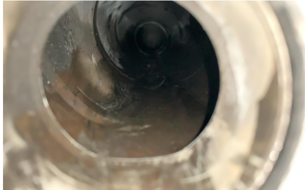
We ensured the pipeline and condensate trap is clear from any blockage