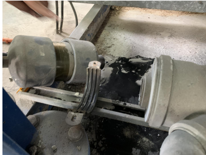
We removed the condensate trap to inspect further