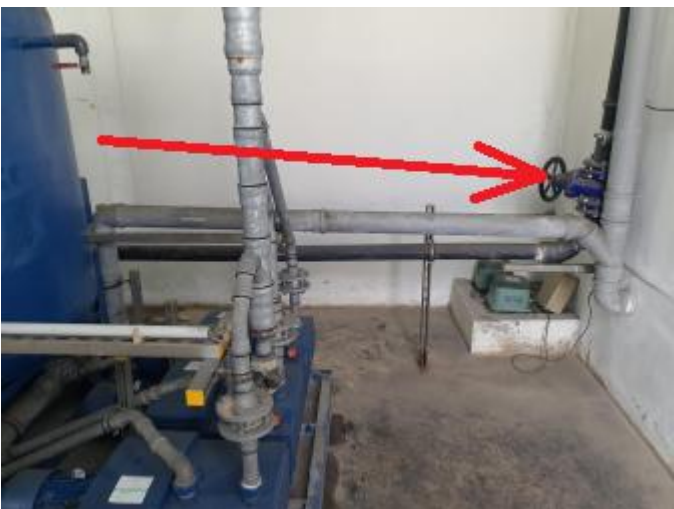
We readjusted the pipeline gradient to ensure smooth flow of condensate water into the trap and towards biofilter. Water ponding in pipeline solved.