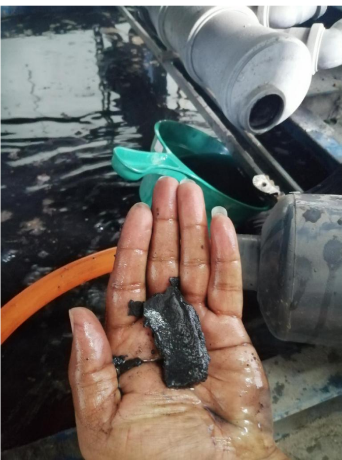
Compacted debris removed from the condensate trap