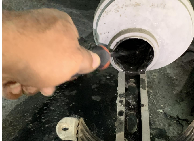
We noticed a piled up debris in the exhaust line