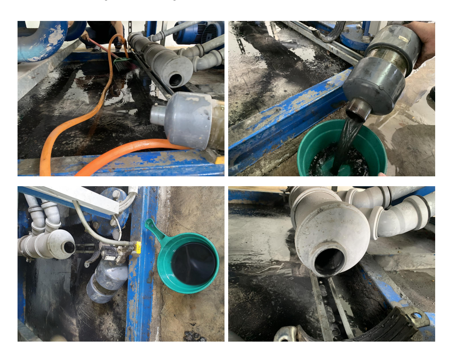
Further servicing works carried out until water comes out clean