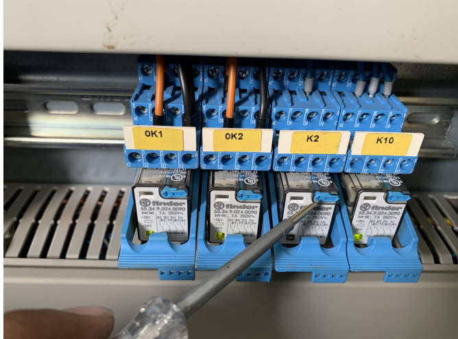
After investigation we conclude there is no problem with the panel