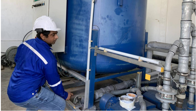
We noticed there was heavy water flow dripping out from the vacuum pump exhaust line.