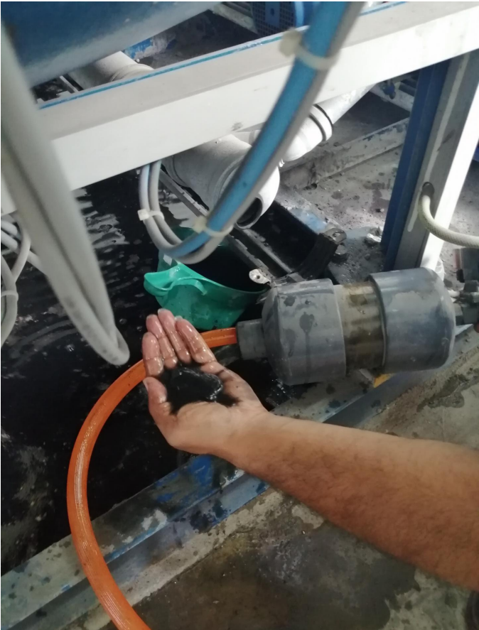
We carried out servicing by using water pressure